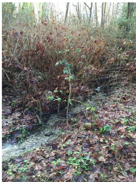
Photo 2. Wetland 4, near the western edge facing north (December 19, 2014).